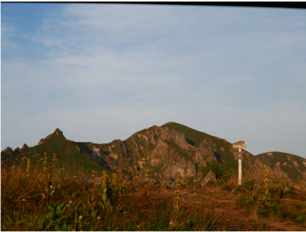
Point of view on the Sancy marking the entrance to the reserve