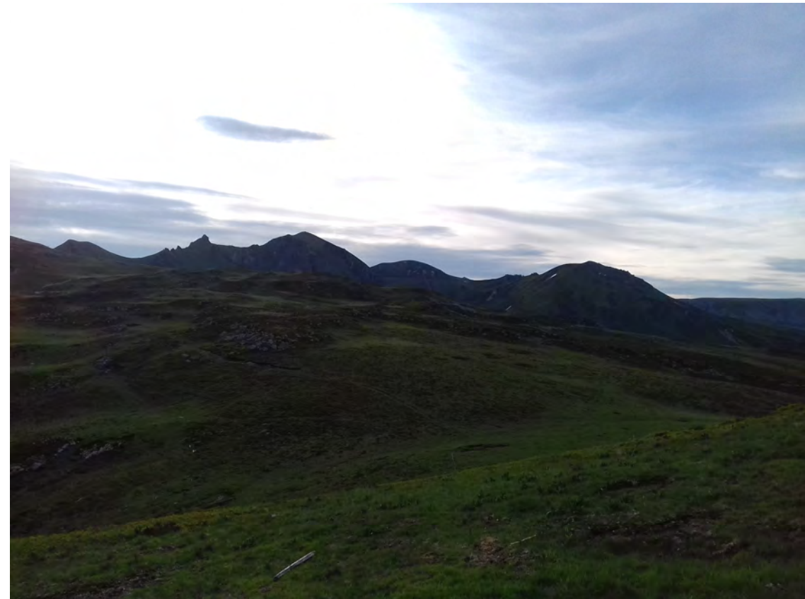
The site seen from the foot of the Roc de Courlande