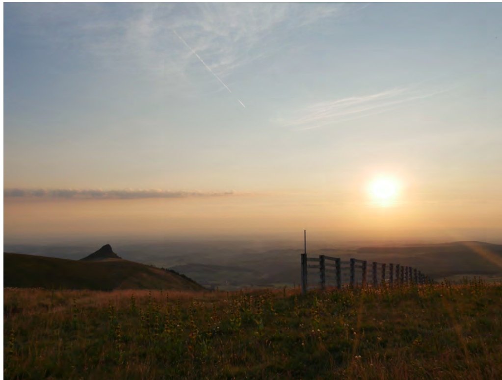
The peak on the left is named The Roc de Courlande