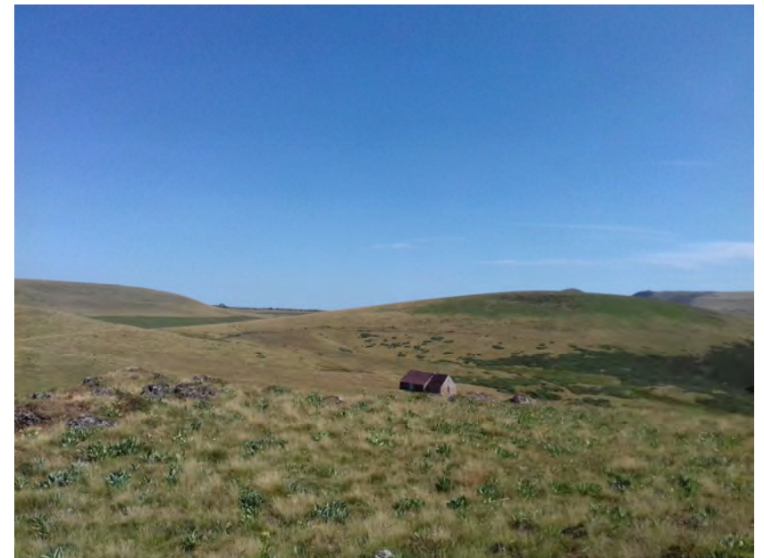
The buron of Montille seen from the top