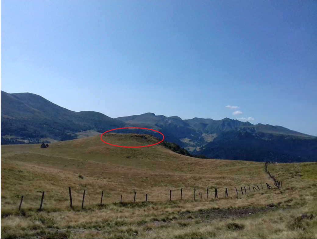
Pic without name and burons seen since the GR30