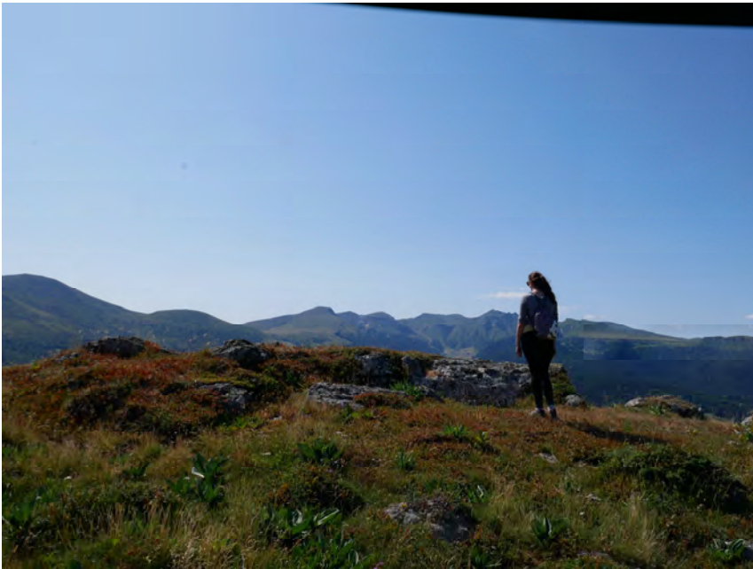
The ground at the top is dotted with rocks