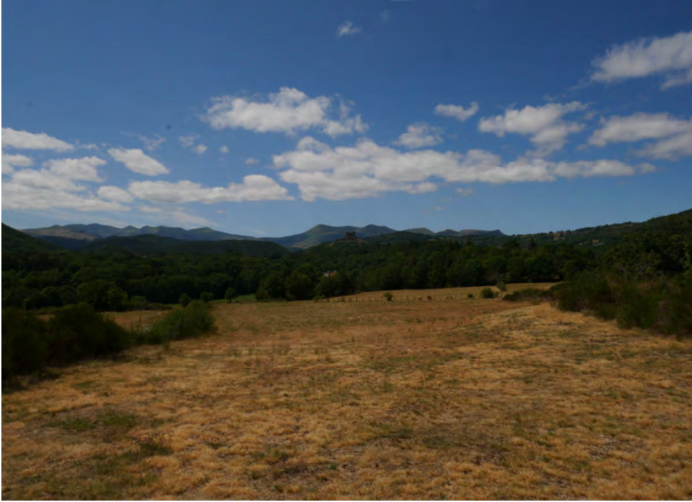
The view of the Château de Murol and the eastern slopes of the Massif