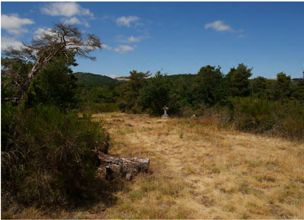
Cross view from the track