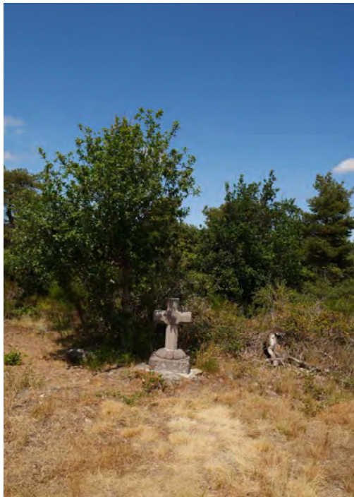
The cross and its base